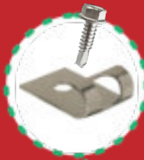
Wire guide brackets w/screws