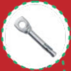
Tie wire wedge anchors